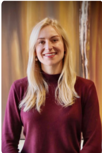
Business Valuation Analyst