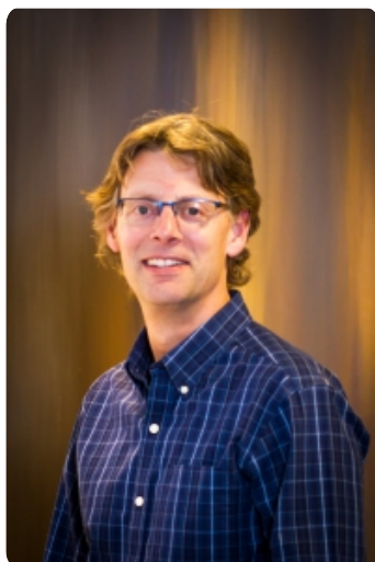
Business Valuation & Litigation Support Partner